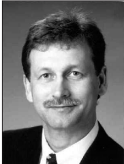
Frank Quennell, Q.C. Minister of Justice and Attorney General

The Honourable Frank Quennell, Q.C. Minister of Justice and Attorney General